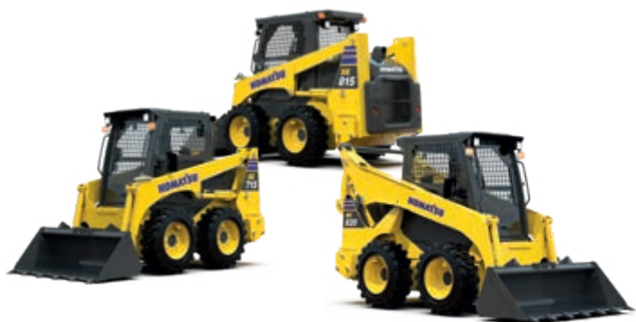
A range of new skid steer loaders