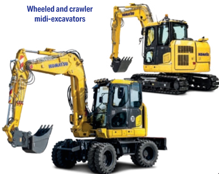
Wheeled and crawler midi-excavators