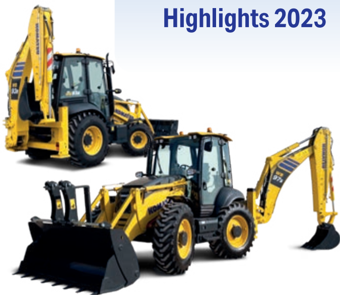
Rigid and 4-wheel-steering backhoe loader models