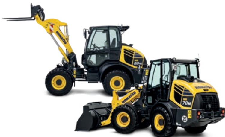
Compact wheel loaders