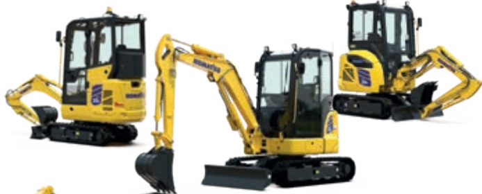
Electric mini excavators