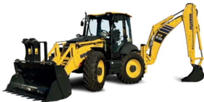
New rigid and 4-wheel-steering backhoe loader models