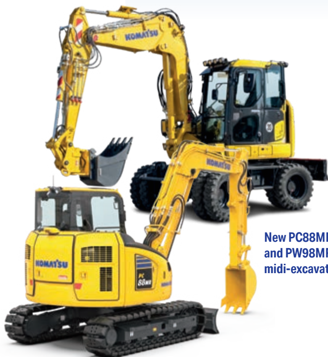
New PC88MR-11 and PW98MR-11 midi-excavators