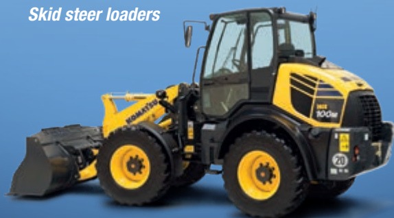
New WA100M-8 compact wheel loader