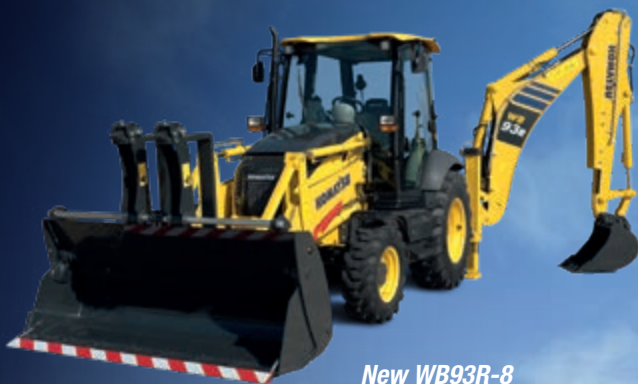
New WB93R-8 backhoe loader

Komatsu offers a complete utility range, with over 30 different compact machines. All our utility models are comfortable and versatile high performers with precise control and designed for easy maintenance.