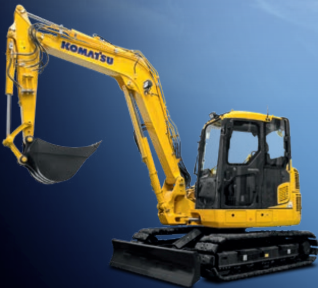
Short tail crawler midi-excavators