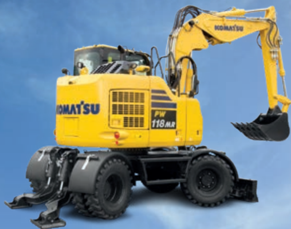
Short tail wheeled midi-excavators