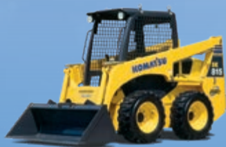
Skid steer loaders