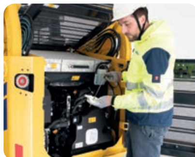
Easy access to daily maintenance points

By a touch on the monitor panel, the radiator can be cleaned easily with a reversible, hydraulically driven cooling fan. A clean radiator reduces fuel consumption and increases overall machine performance.