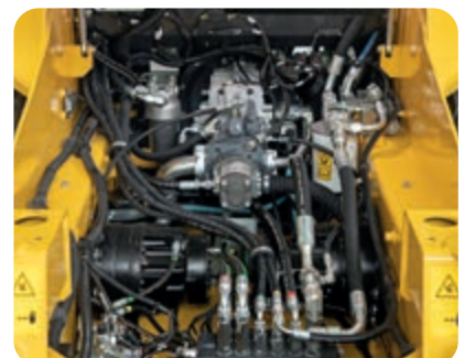
The tiltable cab can be raised in just a few minutes, providing easy access to the main valve and key hydraulic components