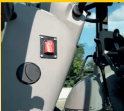
Secondary engine shut down switch