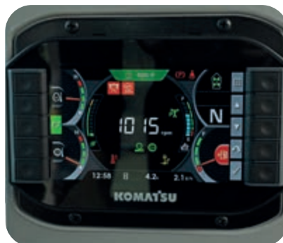
7" multi-function monitor