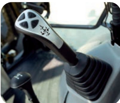
Convenient, ergonomic and precise control

A high-definition 7" LCD monitor provides excellent visibility. The high-definition LCD panel is less affected by the viewing angle and surrounding brightness, ensuring excellent visibility. Various alerts and machine information are displayed in a simple format. Useful information such as operation records, machine setting and maintenance data are also provided. The operator can easily navigate through screen pages with intuitive side buttons.